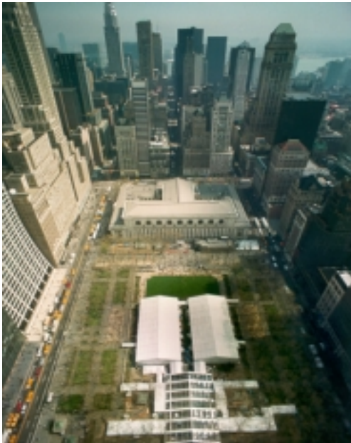
7th on Sixth Fashion Shows NYC, NY

A Form Architecture pc has a unique ability to bridge and intergrate the theatrical show world with the traditional construction professional services world. We design special events to the high standards set by the clients and local building officials.