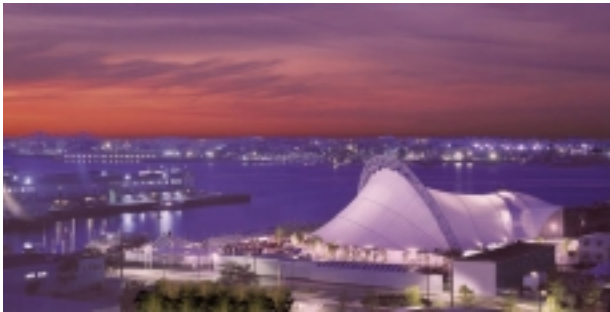
35,000 square feet covered music facility