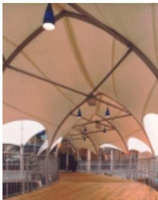
Curved bridge cover