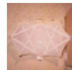
Model - Plan