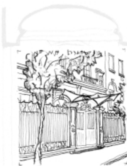
Sketch of Entry w/Canopy

By working directly with a fabricator, we identified a design and budget for the custom awning, which enabled us to stay competitive with a typical awning company.