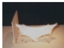
Model - Perspective