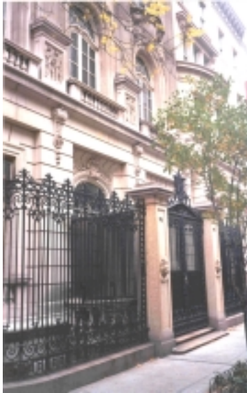
Japanese Mission Entrance

A.Form architecture pc was contacted by Platt Beyer Dovell Architects to submit a proposal for a custom entrance canopy. The canopy will compliment the current renovation to this landmark 100 year old building.