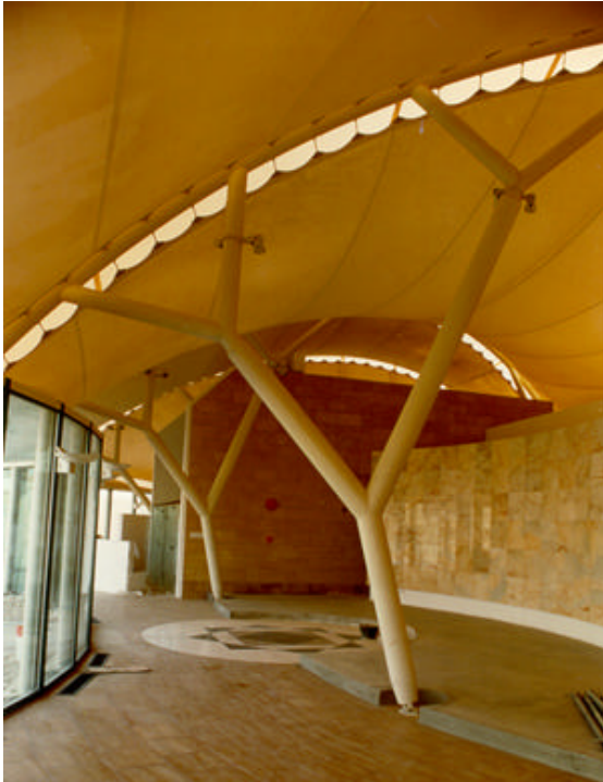
Top right: The computer model of the recreational center.