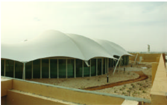
Bottom left: Located on top of the Ministry of Public Affairs Building, the penthouse overlooks Riyadh

The tensile structures supporting columns, or "trees" created a clear interior space for squash courts and other sports equipment. The building was also sealed to create an efficient conditioned interior space for the harsh Riyadh climate.